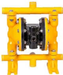
EUCI 150 Bolted