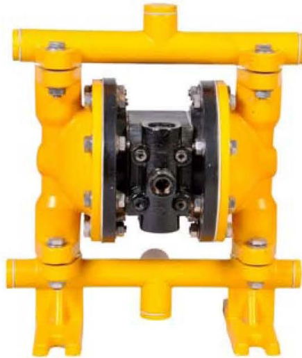
EUAL 150 Bolted