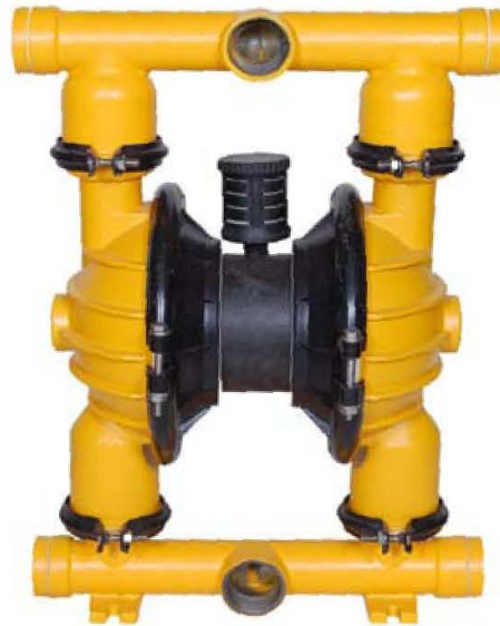
EUAL 40 Clamped