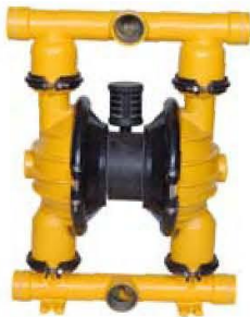
EUCI 40 Clamped