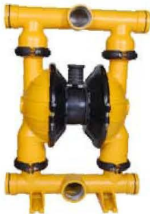
EUCI 80 Clamped