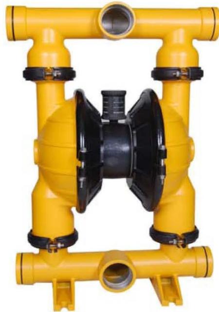
EUAL 80 Clamped