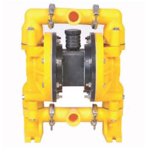
EUPP 300 Bolted