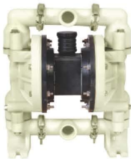
EUPVDF 300 Bolted