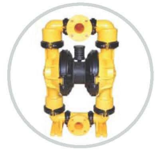
EUPP 50 Clamped

CLAMPED model available for specific applications