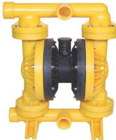
EUPP 500 Bolted