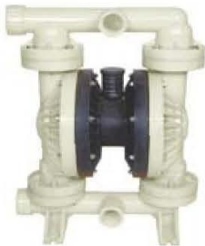
EUPVDF 500 Bolted