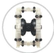
EUPVDF 50 Clamped

CLAMPED model available for specific applications