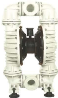
EUPVDF 800 Bolted