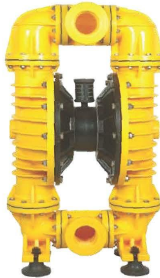
EUPP 800 Bolted