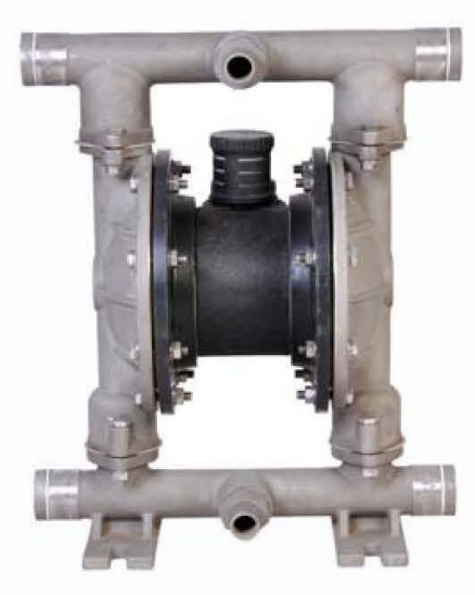
EUSS 300 Bolted