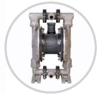
EUSS 30 Clamped

CLAMPED model available for specific applications