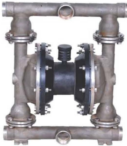
EUSS 400 Bolted