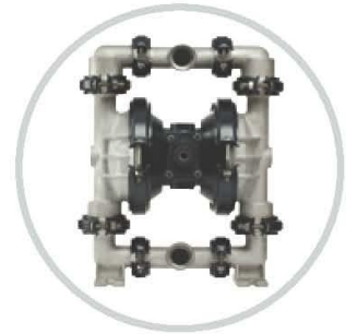
EUSS 40 Clamped

CLAMPED model available for specific applications