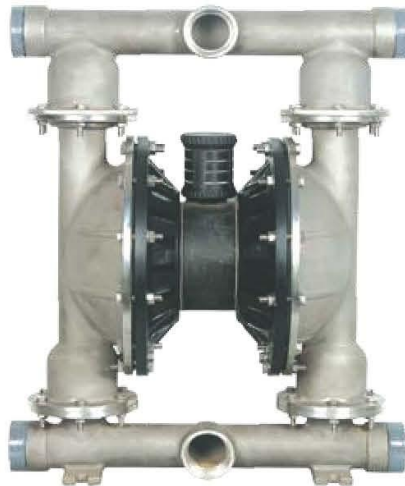
EUSS 500 Bolted