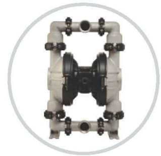
EUSS 55 Clamped

CLAMPED model available for specific applications