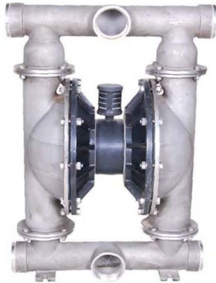
EUSS 800 Bolted